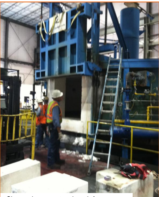
Charge door on rotary hearth furnace